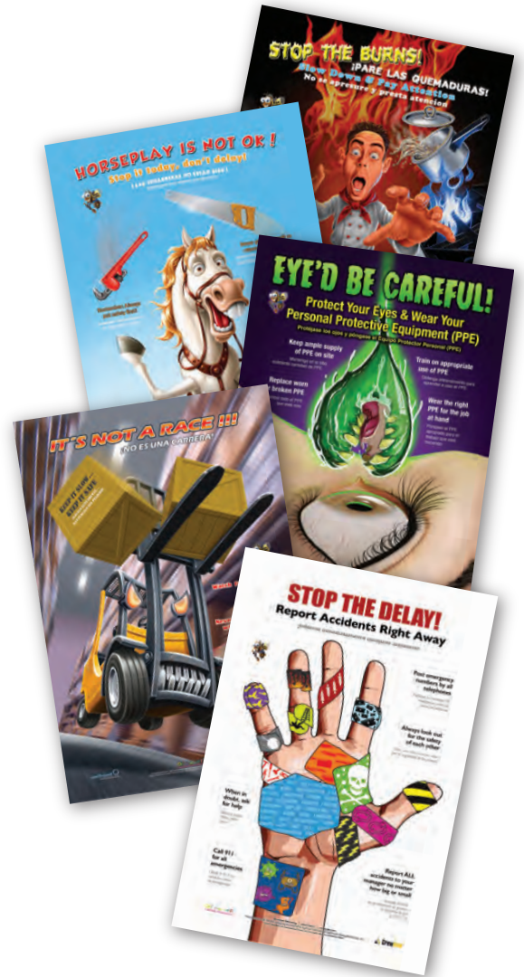
11 in x 17 in (~28 cm x 43 cm)